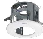
WV-QEM101-W Ceiling Mount Bracket