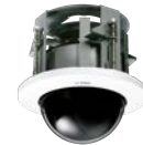
WV-QED100C-W Ceiling Mount Bracket