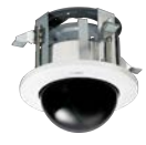
WV-QED100G-W Ceiling Mount Bracket