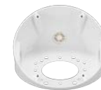
WV-QJB507-W Mount Bracket