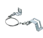
WV-Q105A Mount Bracket