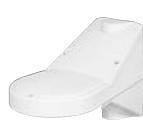
WV-QWL504-W Mount Bracket