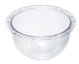
WV-QDC503C Dome Cover