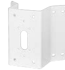
WV-QCN500S-W Mount Bracket