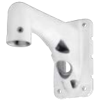
WV-QWL501S-W Wall Mount Bracket