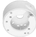
WV-QJB502A-W Mount Bracket