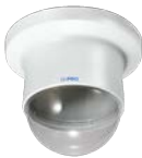
WV-QCD100C-W Dome Cover