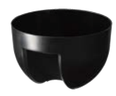
WV-QAT100 Inner Cover