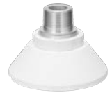
WV-QSR506M-W Mount Bracket