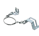
WV-Q105A Mount Bracket