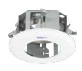
WV-QEM505-W Ceiling Mount Bracket