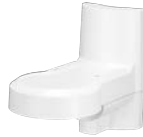
WV-QWL502-W Mount Bracket