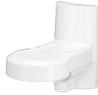
WV-QWL502-W Mount Bracket