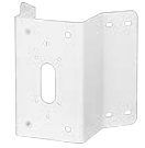
WV-QCN500S-W Mount Bracket