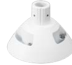
WV-QSR504S-W Mount Bracket