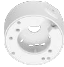
WV-QJB502A-W Mount Bracket