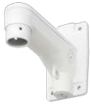
WV-QWL5065-W 4-screw Wall Mount Bracket (Salt resistant)