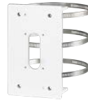
WV-QPL5005-W Mount Bracket