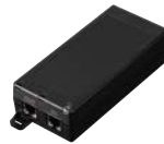
WJ-PU201P PoE Injector