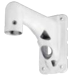
WV-QWL5015-W Wall Mount Bracket