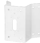
WV-QCN5005-W Mount Bracket