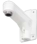
WV-QWL506M1-W ANSI Male Wall Mount Bracket (1.5" NPT)