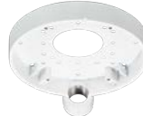
WV-QJB504-W Base Bracket