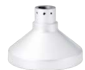
WV-QSR501-W Mount Bracket