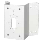
WV-QCN500-W Mount Bracket