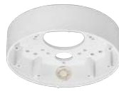
WV-QJB501-W Base Bracket