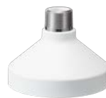
WV-QSR501M1-W Mount Bracket