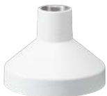
WV-QSR501F-W Mount Bracket