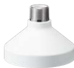
WV-QSR501M-W Mount Bracket