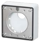
WV-QB500-W Mount Bracket