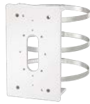
WV-QPL500-W Mount Bracket