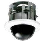
WV-QED100C-W Ceiling Mount Bracket