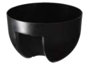
WV-QAT100 Inner Cover