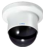
WV-QCD100G-W Dome Cover