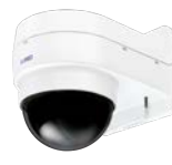
WV-QWD100G-W Wall Mount Bracket