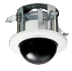
WV-QED100G-W Ceiling Mount Bracket