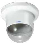
WV-QCD100C-W Dome Cover