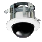
WV-QED100G-W Ceiling Mount Bracket