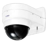
WV-QWD100C-W Wall Mount Bracket