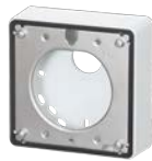
WV-QIB500-W Mount Bracket