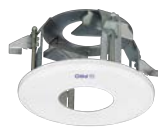
WV-QEM501-W Ceiling Mount Bracket