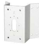
WV-QCN500-W Mount Bracket