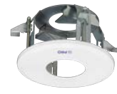
WV-QEM501-W Ceiling Mount Bracket