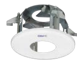
WV-QEM501-W Ceiling Mount Bracket