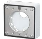
WV-QIB500-W Mount Bracket