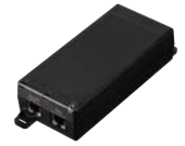
WJ-PU201P PoE Injector