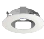
WV-QEM100-W Mount Bracket