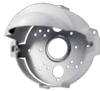
WV-QSR500-W Sun Shade