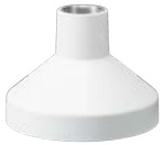
WV-QSR501F-W Mount Bracket