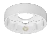
WV-QJB501-W Base Bracket