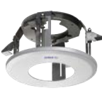
WV-QEM500-W Mount Bracket