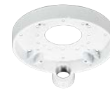
WV-QJB504-W Base Bracket