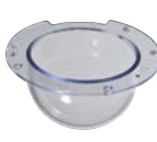
WV-QDC504C Dome Cover