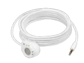
WV-PM500 Compact microphone unit