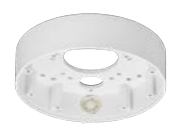
WV-QJB501-W Base Bracket