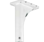
WV-QCL501-W Mount Bracket