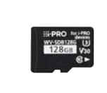
WV-SDB128G i-PRO SD Memory Card