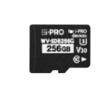
WV-SDB256G i-PRO SD Memory Card