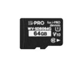
WV-SDB064G i-PRO SD Memory Card