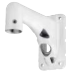
WV-QWL501S-W Wall Mount Bracket