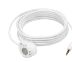
WV-PM500 Compact microphone unit