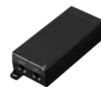
WJ-PU201P PoE Injector