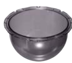
WV-QDC503G Dome Cover