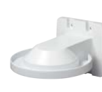
WV-QWL500-W Mount Bracket