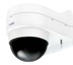
WV-QWD100G-W Wall Mount Bracket