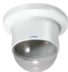
WV-QCD100C-W Dome Cover