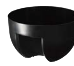
WV-QAT100 Inner Cover