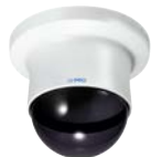
WV-QCD100G-W Dome Cover