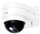
WV-QWD100C-W Wall Mount Bracket