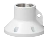
WV-QCL100-W Mount Bracket