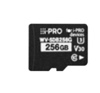
WV-SDB256G i-PRO SD Memory Card