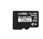
WV-SDB128G i-PRO SD Memory Card