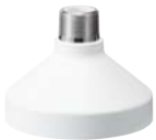
WV-QSR501M-W Mount Bracket