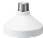
WV-QSR501M1-W Mount Bracket