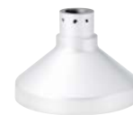
WV-QSR501-W Mount Bracket