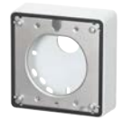
WV-QIB500-W Mount Bracket