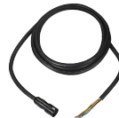
WV-QCA502 I/O Cable for Aero PTZ camera