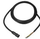
WV-QCA502 I/O Cable for Aero PTZ camera