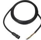
WV-QCA502 I/O Cable for Aero PTZ camera