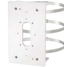
WV-QPL500-W Mount Bracket