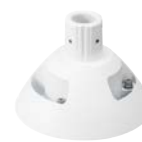
WV-QSR504-W Mount Bracket