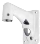
WV-QWL501S-W Wall Mount Bracket