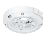
WV-QCL500-W Ceiling Mount Bracket