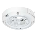
WV-QCL500-W Ceiling Mount Bracket