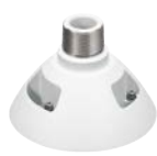
WV-QSR504M1-W Mount Bracket