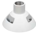
WV-QSR504F-W Mount Bracket