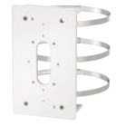
WV-QPL500-W Mount Bracket