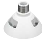
WV-QSR504M-W Mount Bracket