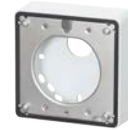
WV-QJB500-W Mount Bracket