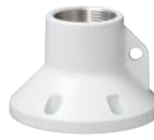
WV-QCL101-W Mount Bracket