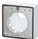
WV-QJB500-W Mount Bracket