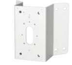
WV-QCN500-W Mount Bracket