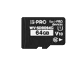
WV-SDB064G i-PRO SD Memory Card