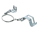
WV-Q105A Mount Bracket