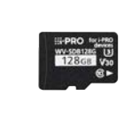
WV-SDB128G i-PRO SD Memory Card