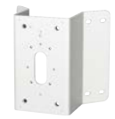
WV-QCN500-W Mount Bracket