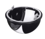
WV-QDC508C Dome Cover