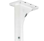
WV-QCL501-W Mount Bracket