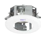
WV-QEM505-W Ceiling Mount Bracket