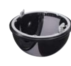
WV-QDC508G Dome Cover