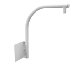
PPRM35W Parapet Mount Bracket