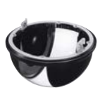
WV-QDC508CN Dome Cover