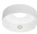
WV-QB505-W Base Bracket