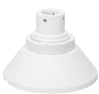
WV-QSR506-W Mount Bracket