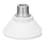
WV-QSR506M-W Mount Bracket