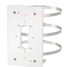
WV-QPL500-W Mount Bracket