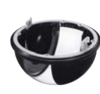
WV-QDC508C Dome Cover