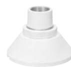
WV-QSR506F-W Mount Bracket