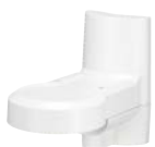
WV-QWL502-W Mount Bracket