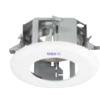
WV-QEM505-W Ceiling Mount Bracket