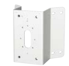
WV-QCN500-W Mount Bracket